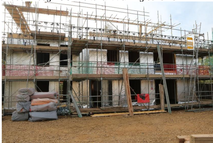
Timber frame being installed at Croft's Court

The site known as Crofts Court will be sustainably built, with high levels of insulation, clean energy generated from roof-top solar panels to reduce energy bills, and permeable landscaping to minimise water run-off. The development is also unique in that it will require prospective tenants from the Vale's Housing Register (who will have a strong local connection to Cumnor Parish) to join a tenant management co-operative to help manage and run the building. This should create a strong residential community and enable the tenants to develop useful employment skills provided through OCLT's tenant training scheme.