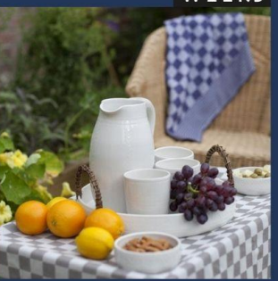
14 to 22 May