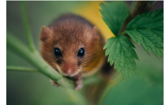
hazel dormouse.

In Britain, dormice – known for their endearing appearance with soft caramel fur, furry tail and big black eyes – are threatened and are considered to be vulnerable to extinction. In fact, hazel dormice are already extinct from 17 counties in England. The areas where they are still known to exist are almost all entirely south of a line between Shropshire and Suffolk.